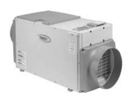
Aprilaire Whole Home Humidifier